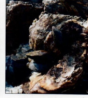
National Fish and Wildlife Foundation